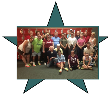
Bowl-a-thon May 11th

Please have a check made out to - St. Thomas Church - clearly marked for the CHOIR. You may give it to any choir member or mail to the church office - again, CLEARLY MARK CHOIR on your check.