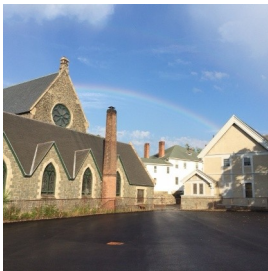
Rainbow over St. Thomas

In addition to keeping you on our prayer list, our Pastoral Care Team is available, upon request, to visit and take communion to those who are sick/shut-in or hospitalized.